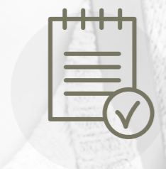
ADMISSION REQUEST + CV

In the personal interview with the program director , the personal and professional objectives of the candidate are analyzed, as well as the fit between the latter and the program. In addition, the interested party is informed about: the structure of the program, the methodology applied, the faculty, the dedication on the part of the candidate and the level of demand.